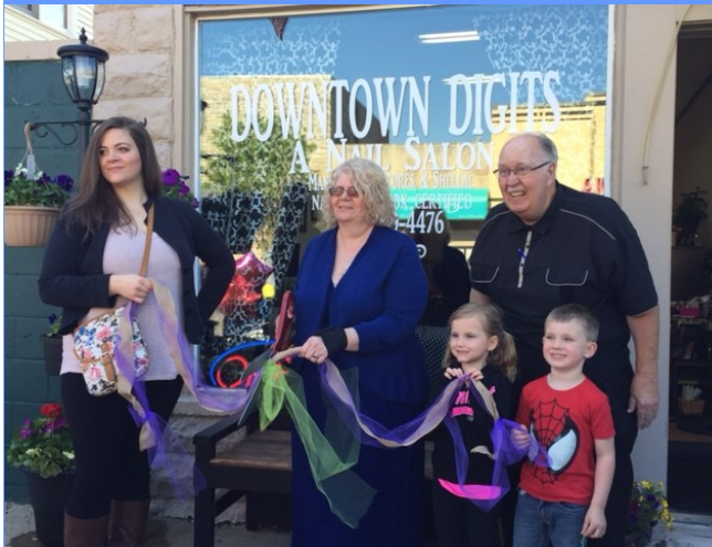
May was a very fun and busy time with events. We congratulate these great businesses on letting us help them promote their business and really enjoyed the opportunity to showcase them as they are important part of the Coloma and Watervliet area. If you want to do an After Hours event contact the office at 468-4430.